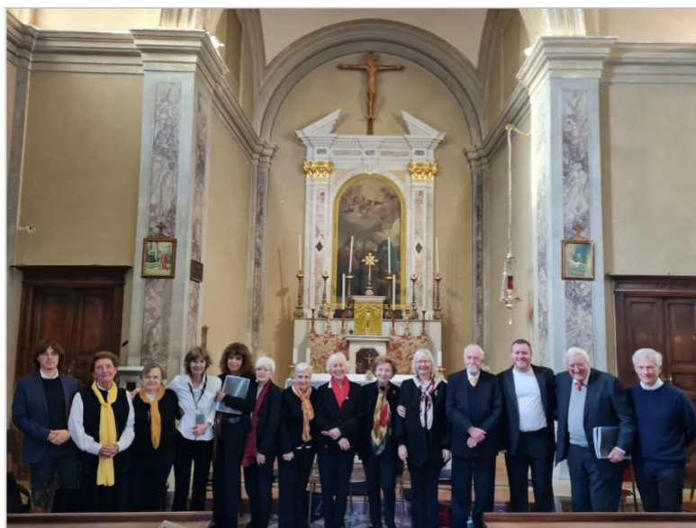
The Choir at Gorgonzola.

A big thank you to all who came along to listen, donated and participated in the events, and to the musicians and organisers who gave of their time and abilities so freely.