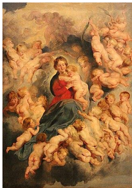
The Virgin and Child surrounded by the Innocents - Rubens

On 28 December, the Church commemorates the Feast of the Holy Innocents, when Herod the Great ordered the slaughter of all Bethlehem male first-born under two years old, after learning of the birth of our Lord from the Magi.