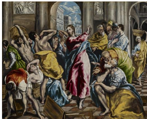
Christ cleansing the Temple El Greco

Churchwarden allsaintsmilanwardens@gmail.com