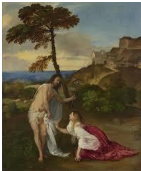
Titian's 'Noli me Tangere' from the National Gallery, London