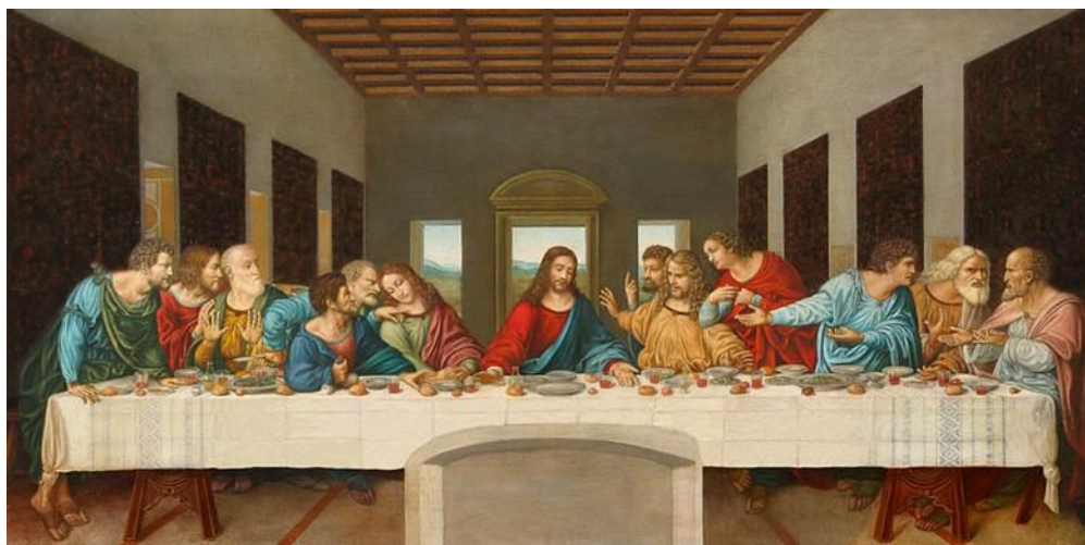
Da Vinci's Last Supper is painted on the wall of the refectory of the Convent of Santa Maria delle Grazie, in Milan