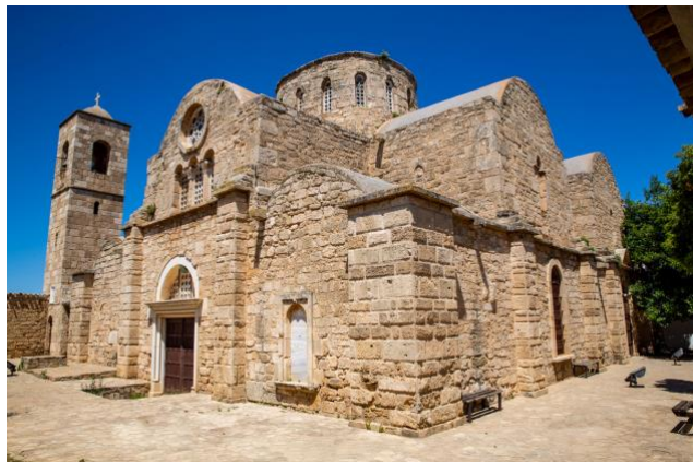
The Monastery of St Barnabas near Salamis, Cyprus. His tomb is underground, a short distance from the building.

St Barnabas is the patron saint of Cyprus, and also reputedly was the first bishop of Milan.